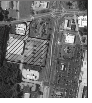
AERIAL VIEW N.T.S.